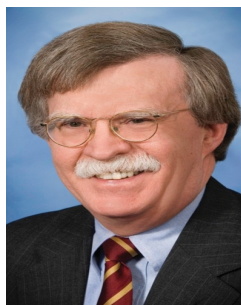
Amb. John Bolton