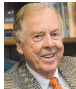
Mr. T. Boone Pickens